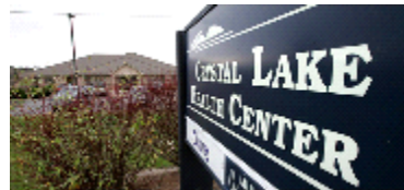
A Rural Health Clinic in Michigan

http://www.narhc.org/members/orhp_series.php