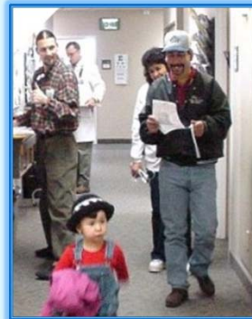
Yakima Valley Farm Workers Clinic, Toppenish