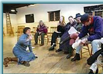
Nurse Practitioner 2004 National Health Service Corps, Scholar Forks, WA.

“As a female I see women who have not come in because there wasn't a female provider. In my 1 st year of practice I diagnosed many women's health issues.”