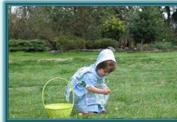
Daughter of two rural Physicians. Olympic Peninsula, Washington