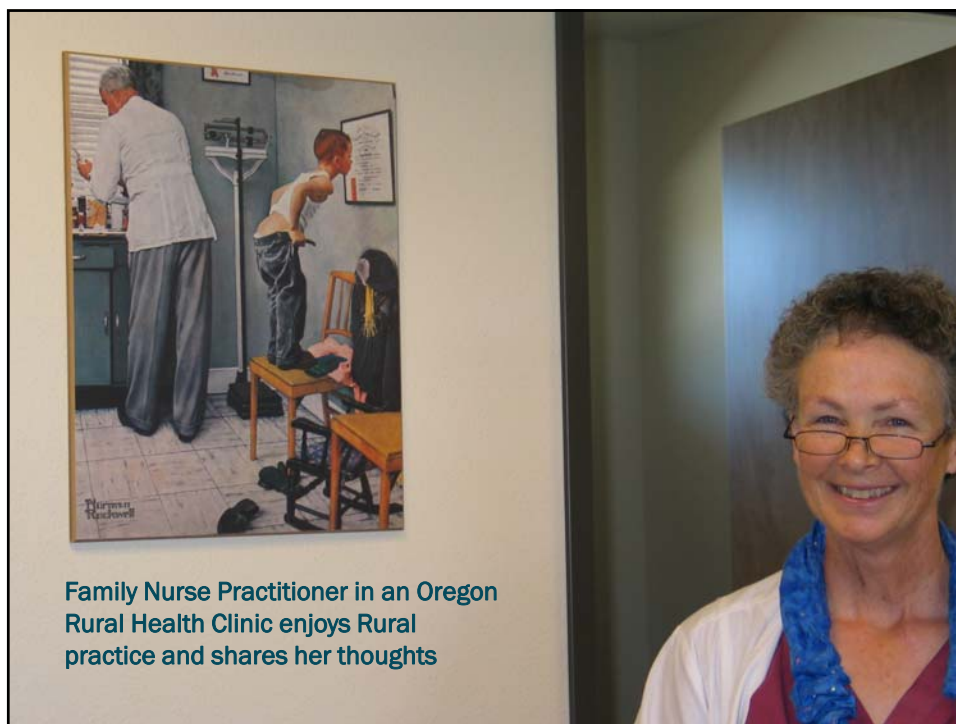
Family Nurse Practitioner in an Oregon Rural Health Clinic enjoys Rural practice and shares her thoughts