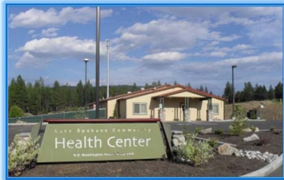
North East Washington Health Programs Chewelah, Washington

Matching healthcare professionals with communities across the nation