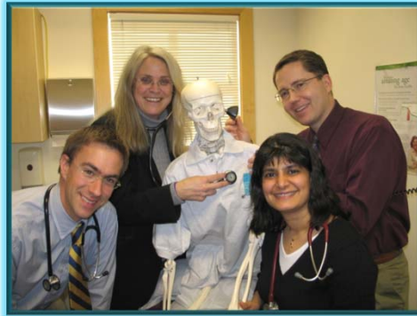
Staff & Physician owners of a Rural Practice Olympic Peninsula, Washington

Matching healthcare professionals with communities across the nation