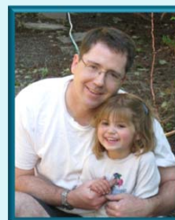
Rural Primary Care Physician with his daughter. Olympic Peninsula, Washington State.