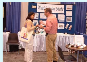
CHC physician recruiting a resident at AAFP