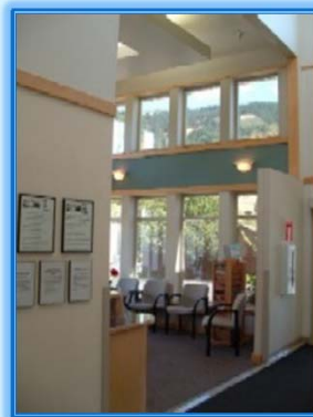
Skyline Hospital White Salmon, Washington Near the "Bridge of the Gods"