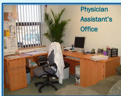
Physician Assistant's Office