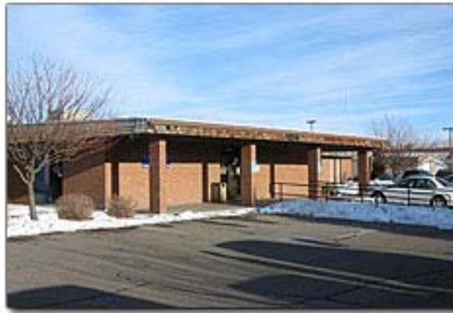
Elko Outreach Clinic

The challenge of providing meaningful healthcare services to veterans living in rural communities is a major public health concern that involves redefining the traditional facility-based model of care delivery employed in urban areas. The Elko Community Outreach Clinic was created to meet the healthcare needs of older veterans who expressed a desire for greater access to VA resources. The Elko Clinic was the activation of an expanded Community-as-Partner model for coordinating local, regional, and VA resources. The clinic provides a limited set of healthcare services including medication management, prescription refills, and routine lab tests.