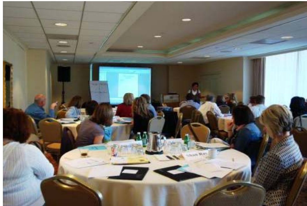
The 2009 Rural Voices Class